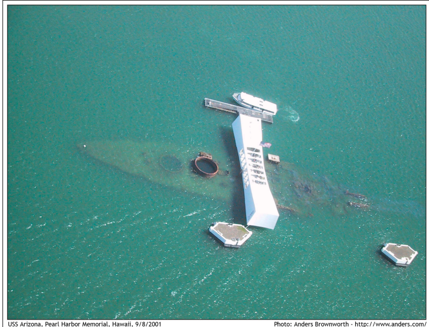
USS Arizona, Pearl Harbor Memorial, Hawaii, 9/8/2001