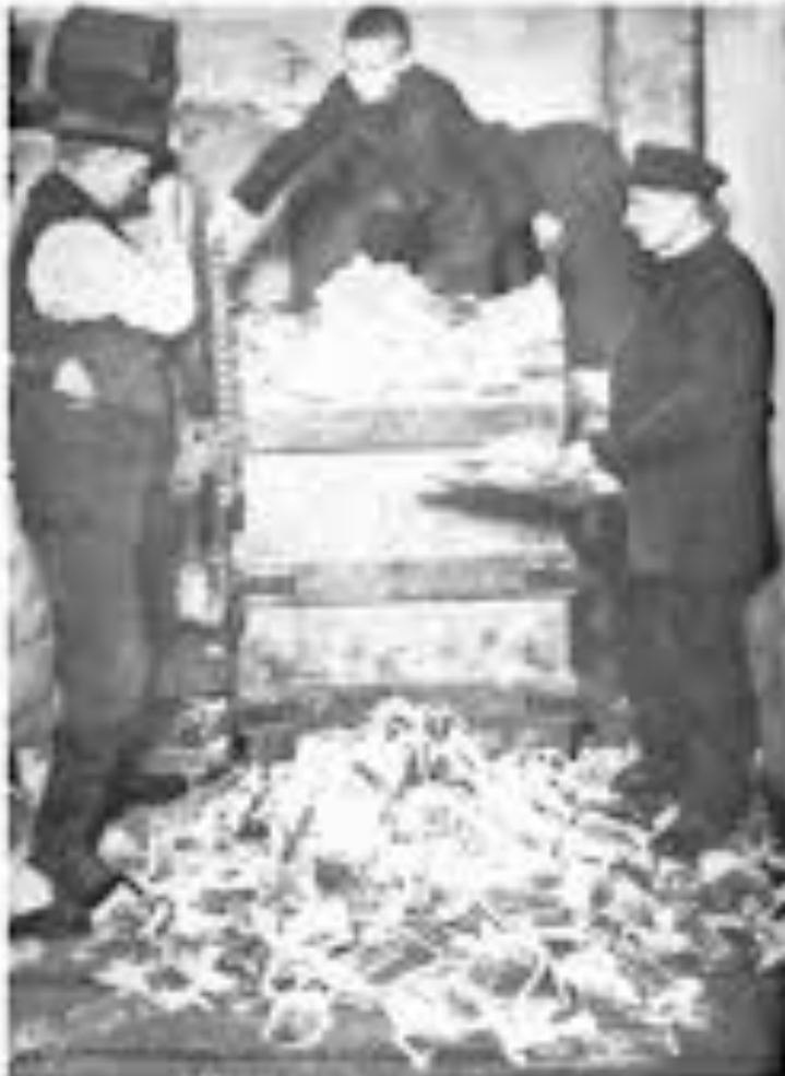
German banknotes being pulped for use as waste paper