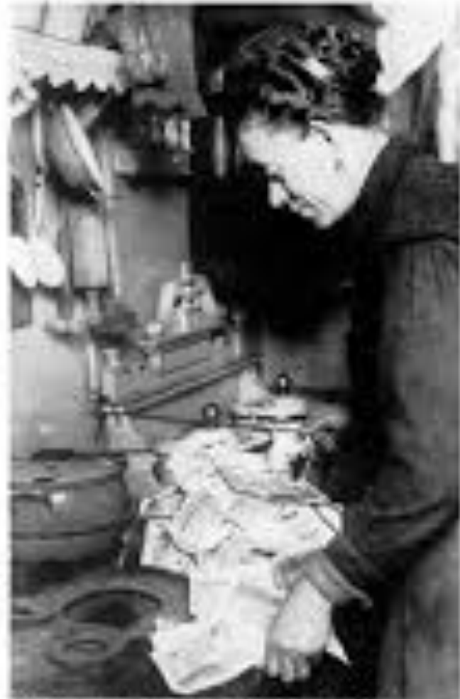
Banknotes used to light the stove (Berlin: 9 August 1923)

http://www.vision.net.au/~benjoc/1923.htm