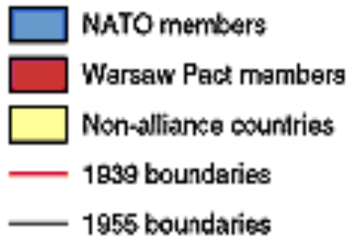
The Cold War Alliances, 1955